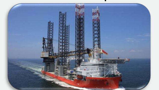
Figur 2: Innovation bio. of Pacific Orca, Swire Blue Ocean Pacific Orca is an offshore installation vessel. Six 105 m legs makes it safe to operate in wind up to 20 m/s.

Most studies treat innovation as an outcome measured by patents or innovation statistics, however it is important to remember that innovation processes are contingent processes that unfold over time. Consequently, I apply an 'innovation biography approach' that focuses on the entire "lifespan" of the innovation process from idea generation through problem solving to implementation. Hereby, I can study the type of knowledge, its geographical source and when during the innovation process companies chose to integrate external knowledge. The study comprises three innovative event, each has been documented through 2-3 interviews per case including secondary data and documents.