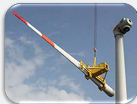
Figur 1: Innovation biography of Blade Dragon, Liftra A/S Blade Dragon is a yoke that enables installing blades on rotors in most angles (+30 to -5). It can perform in wind up to 12 m/s.

The wind power industry has undergone significant change during the last couple of decades which has resulted in an internationalisation of the industry. Due to a strong focus on mitigating the environmental impact of energy production as well as increasing energy security we see a continuously increasing world wide demand for renewable energy sources, including wind power. This has attracted a diverse range of OEMs from different world regions and today the industry is no longer dominated by Danish wind turbine manufacturers. Activities related to manufacturing, sales and more recently research and development has been internationalised. This study focuses on suppliers located in Denmark and asks whether these companies are able to adapt to the new international agenda and take advantage of both local and international knowledge sources in the development of new innovations.